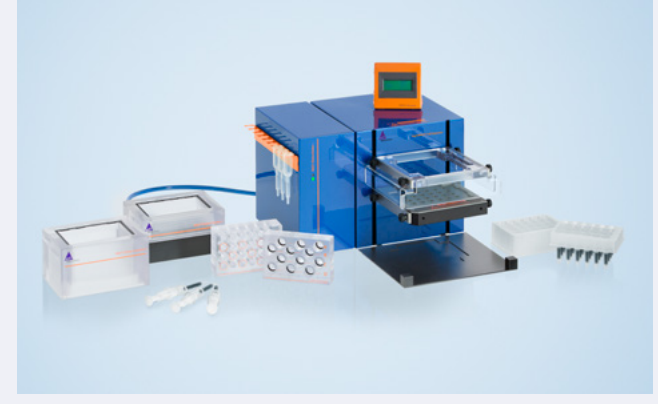
Figure 1: The MultiMACS Cell24 Separator Plus accessories enable higher flexibility to plan your separation.

The instrument is designed for the isolation of virtually any cell type from any source and is compatible with many downstream applications such as molecular and functional assays, chimerism analysis, and flow cytometry.