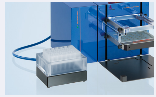
Figure 2: MACS® Elution Station and Elution Chamber enable positive and negative isolation.

The vacuum-driven elution station ensures gentle elution of positively selected cells for excellent purity and maximal cell viability. A vacuum pulse guarantees simultaneous elution with identical parameters for every sample. Deep Well Plates or 5 mL tubes in the Tube Rack can be used to collect the positive and negative fractions.