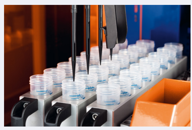
Figure 8: Cooled Chill Racks keep the samples and reagents at 2–8 ^{\circ} C.

The MultiMACS X Chill Racks allow you to keep your samples and reagents at 2-8\,^{\circ} C. By eliminating temperature variations, you achieve higher cell viability rates and reduce alterations in gene expression.