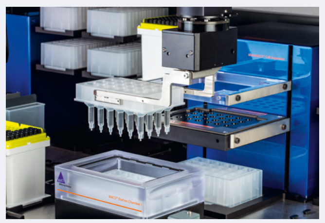
Figure 10: The MultiMACS X is equipped with a gripper arm and a 4-tip liquid handling arm for maximal flexibility and reliability with different applications.

The MultiMACS X can also be installed into third party laminar flow cabinets to ensure a sterile experiment environment.