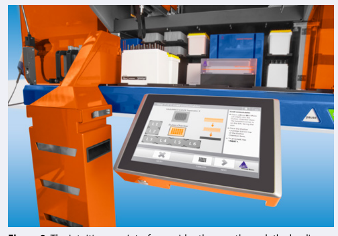
\textbf{Figure 9:} \ \ \text{The intuitive user interface guides the user through the loading steps.}

The touchscreen interface is easy to use for any lab professional and guides users through the automated cell separation process. Access and operation can be restricted to authorized users. During the process, specific sample IDs and reagent information can be recorded by scanning the appropriate barcodes, thus enabling detailed tracking of each sample and a thorough documentation of the separation process. This documentation can subsequently be made available to laboratory information management systems (LIMS).