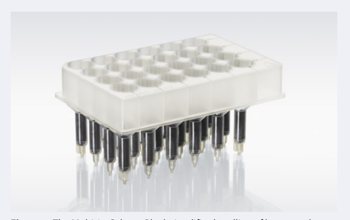
Figure 4: The Multi-24 Column Block simplifies handling of large numbers of columns.

The MultiMACS™ Cell24 Separator Plus enables convenient processing of various samples in parallel or large-volume samples. Using the Multi-24 Column Block or the Single-Column Adapter, you can easily vary the number of samples to process in one run. The Multi-24 Column Block enables convenient handling of up to 24 samples. For cost-effective cell separations with smaller sample numbers, the Single-Column Adapter allows you to use between one and 12 single columns. Large-volume samples such as Leukopaks® are divided evenly between the columns and combined at the end of the run to ensure high-quality separations from every sample, regardless of the volume.