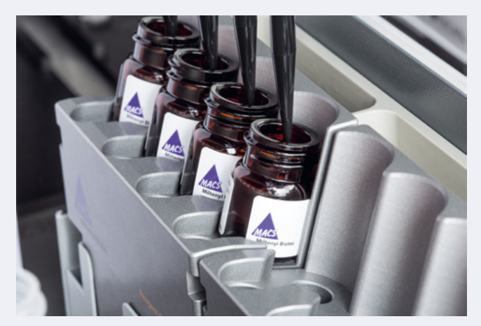
Figure 6: Samples are labeled and incubated on the deck, allowing full walk-away automation.

The MultiMACS™ X is a benchtop platform that combines the benefits of the MultiMACS Cell24 Separator Plus and an integrated liquid handling robot. Full automation eliminates hands-on steps otherwise performed by the operator, such as sample transfer onto the column, washing steps, and buffer pipetting. Magnetic labeling is performed automatically and samples are incubated on the worktable, allowing the user to focus on other tasks without manual interaction with the instrument.