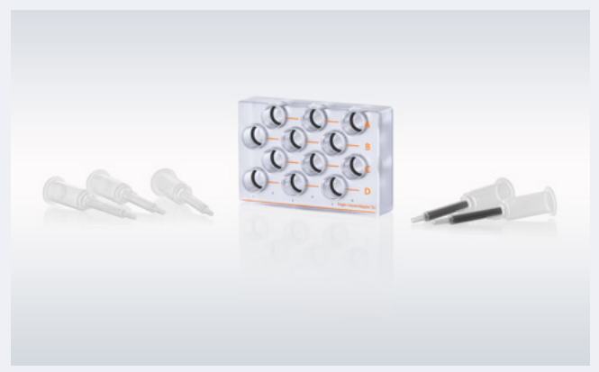
Figure 5: The Single-Column Adapter enables the use of single LS, LD or Whole Blood Columns with the MultiMACS Cell24 Separator Plus.